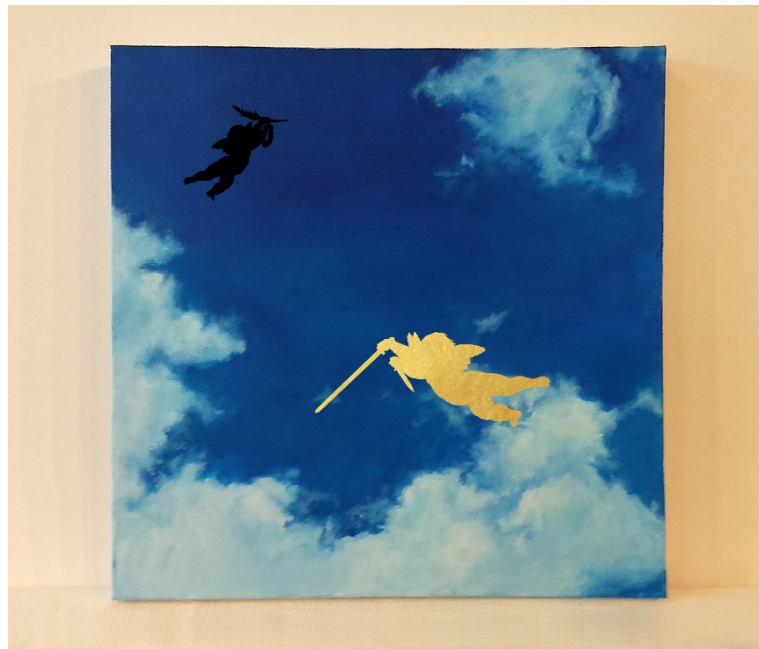
putti 16" x 16" Acrylic on Canvas, Gold leaf 2019 (complete, framed)