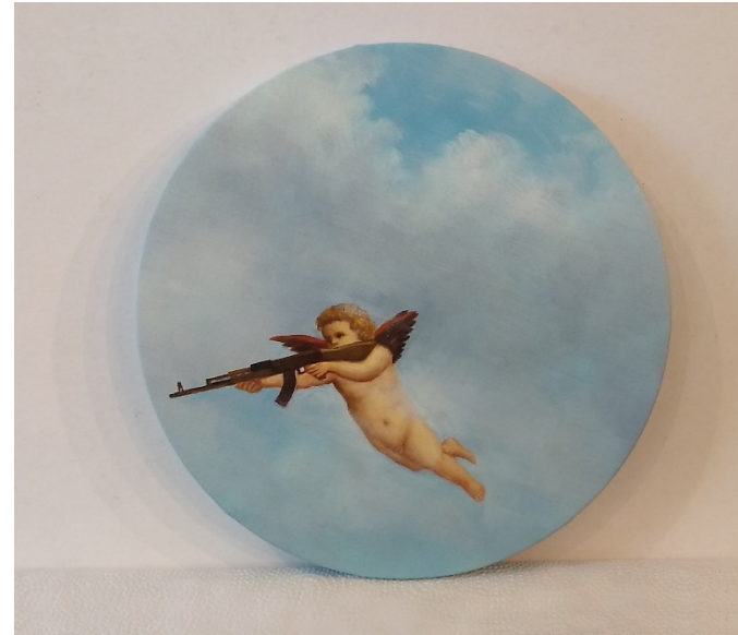
putti 12" x 12" Oil on Canvas 2019 (complete, framed)