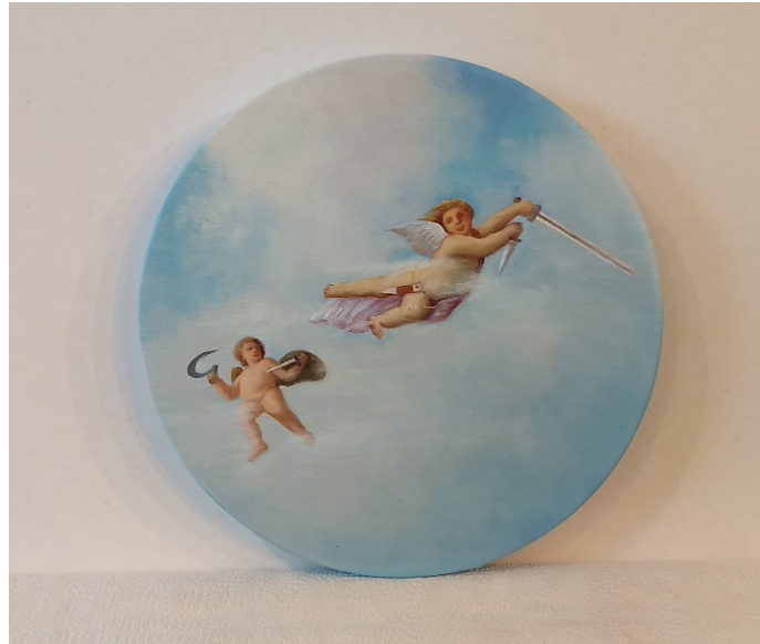
putti 12" x 12" Oil on Canvas 2019 (complete, framed)