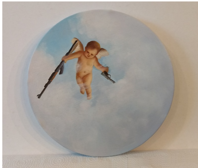
putti 12" x 12" Oil on Canvas 2019 (complete, framed)