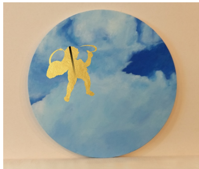
putti 16" x 15" Acrylic on Canvas 2019 (complete, framed)