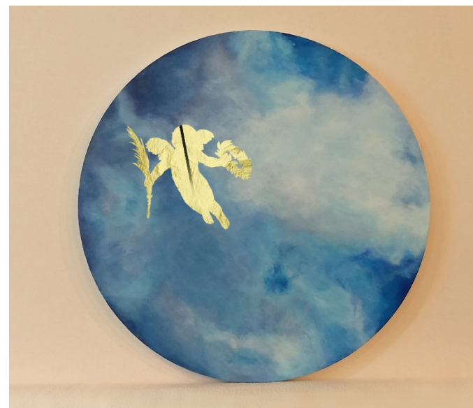
putti 16" x 16" Acrylic on Canvas 2019 (complete, framed)