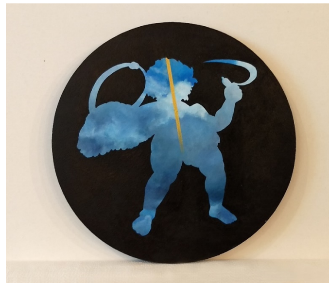
putti 15" x 15" Acrylic on Canvas 2019 (complete, framed)