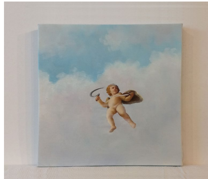
putti 14" x 14" Oil on Canvas 2019 (complete, framed)