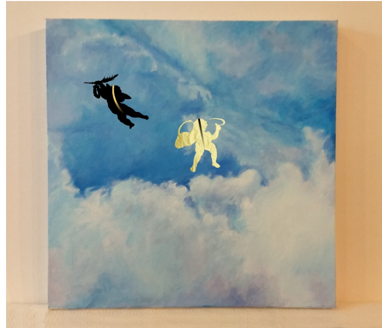
putti 16" x 16" Acrylic on Canvas, Gold leaf 2019 (complete, framed)