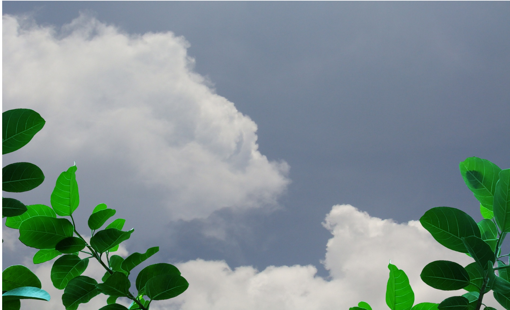
putti 29.5 x 48" Oil on Canvas, Mixed Reality overlays 2019 (complete, framed)