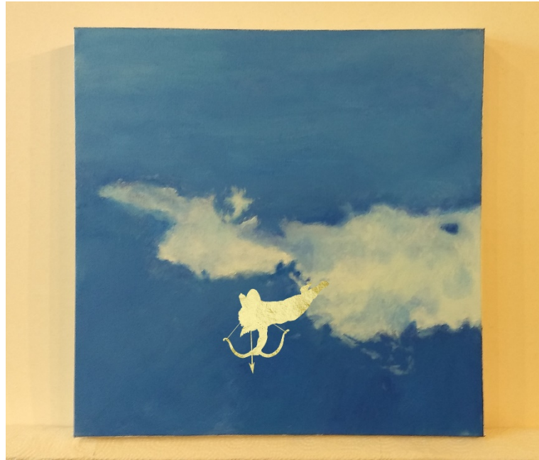
putti 16" x 16" Acrylic on Canvas, Gold leaf 2019 (complete, framed)