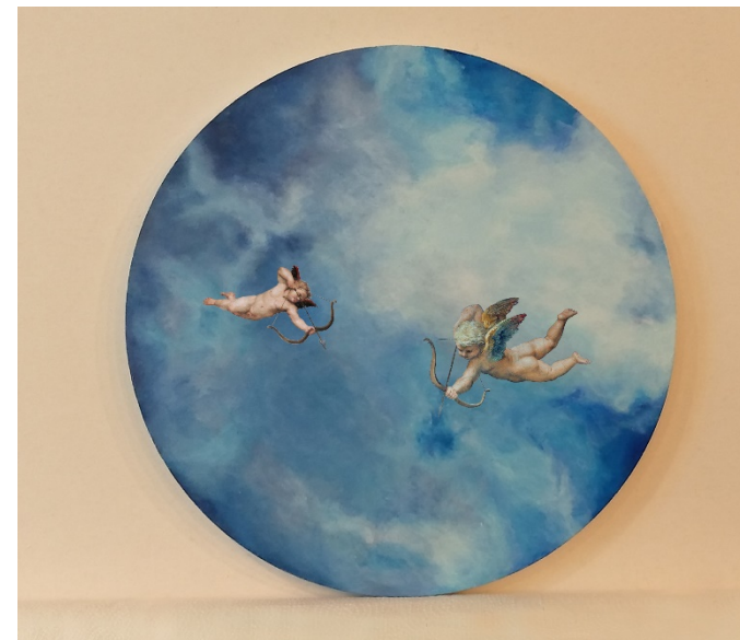
putti 16" x 16" Acrylic on Canvas 2019 (complete, framed)