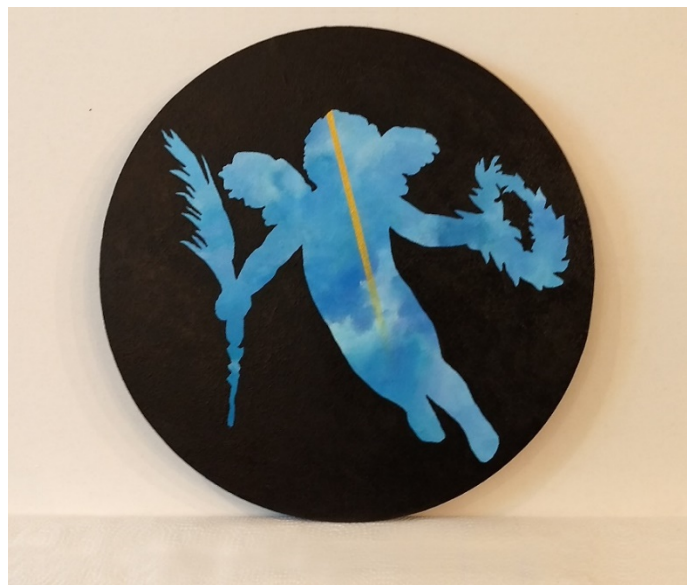
putti 15" x 15" Acrylic on Canvas 2019 (complete, framed)