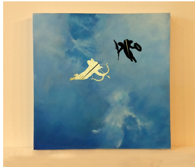
putti 16" x 16" Acrylic on Canvas, Gold leaf 2019 (complete, framed)