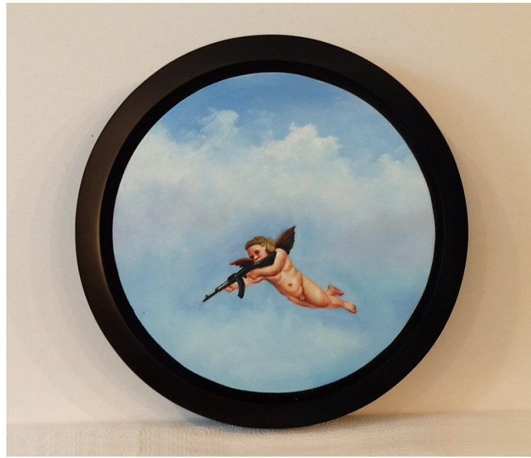
putti 14" x 14" Oil on Canvas 2019 (complete)