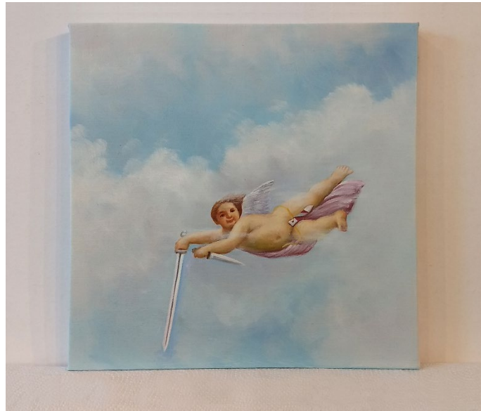
putti 14" x 14" Oil on Canvas 2019 (complete, framed)