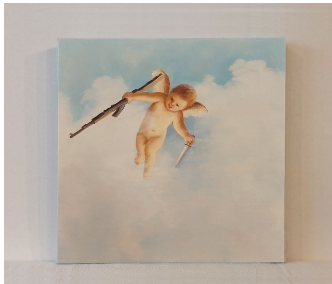
putti 14" x 14" Oil on Canvas 2019 (complete, framed)