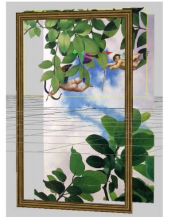
putti 29.5 x 48" Oil on Canvas, Mixed Reality overlays 2019 (complete, framed)