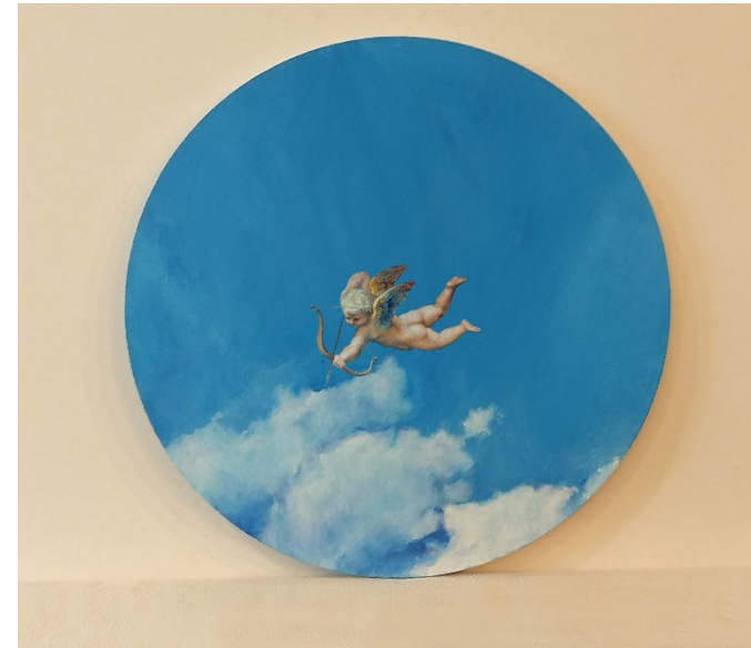
putti 16" x 16" Acrylic on Canvas 2019 (complete, framed)